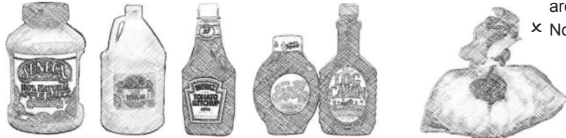
(Plastic bags in a Plastic bag)