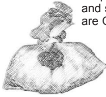
(Plastic bags in a Plastic bag)